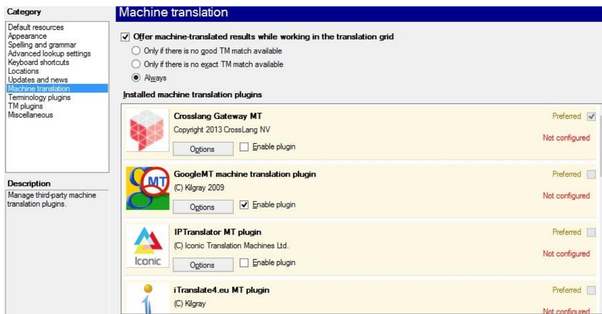
Figure 1. memoQ and MT options

was rather bleak about the use of MT, which delayed the development of the industry. However, since the appearance of computer-assisted translation (CAT) tools, the situation changed. The triangle of translation would have three vertices, MT, CAT and the human translator (HT), which were each trying to demonstrate their own supremacy over the other two. Yet, in the long run, this ‘brawl’ did not prove to be beneficial, so CAT tool vendors began to highlight an important feature of their products, namely ‘aid’ or ‘assistance’, and a giant leap in developing their products was to incorporate MT and offer it as a plugin that can be enabled or disabled during the translation process. The proof of the success is demonstrated by the fact that while in 2008 CAT tools had no built-in MT, year-by-year they began to build in various MT options. For instance, the leading CAT tool worldwide, SDL Trados Studio, now offers SDL Language Cloud Machine Translation 1 , whereas memoQ translation environment has eleven MT plugins: Crosslang Gateway MT, Google MT, IP Translator MT, iTranslate4.eu MT, KantanMT API Connector, Let’s MT, Microsoft MT, Pangea MT, memoQ pseudo-translation, Systran MT, tauyou machine translation, and all of them can be further configured (e.g. language pairs), set as preferred or enabled or not: