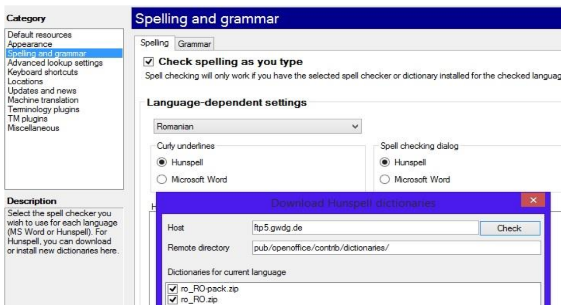
Figure 4. Spelling and grammar in memoQ

Although there were many who were reluctant to accept that CAT tools may offer both reduced work or editing time and enhanced quality, today this is not an issue any more. Furthermore, the Run QA function of memoQ will make use of the Spelling and grammar settings, which makes it possible to use a spell-checker while typing or when proofreading a translation: