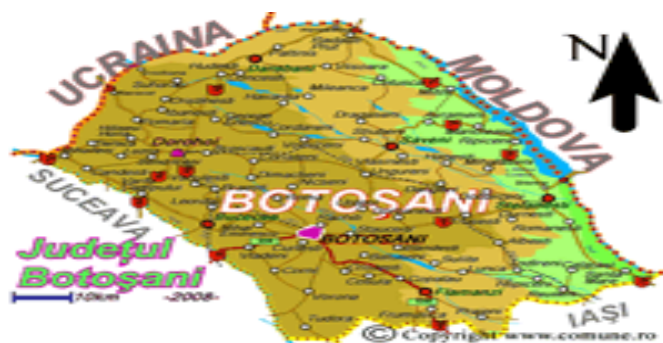
Figure 1 – Administrative-territorial location of Botoșani county

The case study (Chiran and all., 2008, 2009; Băcăuanu, 1968; Tufescu, 1977) focused on the agriculture of Botoșani County, which is located in the N.E. of Romania (Fig. 1):