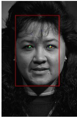
a. Example image GentleBoost Algorithm

the case, we can admit some outliers. The other is finding the minimum of the quadratic programming problem. Generally the minimum is computed iteratively until it converges. The iterative algorithms not necessarily find the global minimum. If a separating hyperplane is found and the detection rate is high enough then the hyperplane can be considered optimal. Figure 2 illustrates the detection comparing the two methods on a FERET [12] database image.